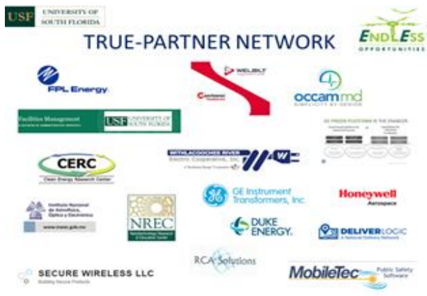
Fig 3. TRUE-Partner Network participating entities