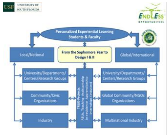
Fig 2. Personalized Experiential Learning Overview

The courses Professional Formation of Engineers (PFE) 1, 2, and 3 have connected the freshman engineering experience to the senior capstone design course by weaving professional skills and competencies (see Career Readiness at National Association of Colleges and Employers – http://www.nacweb.org/career-readiness/competencies/career-readiness-defined/ ) through the students' sophomore and junior years. A key characteristic of the PFE is that it has allowed for an active and a collaborative engagement of students with industry professionals and experiential learning activities beyond the university environment (service projects, community engagement, internships etc.) The course activities have included among others career planning, development and completion of a personalized qualification plan based on each student’s professional goals, innovative design, project management, professional ethics, and entrepreneurship. Students in the inaugural class (PFE 1) identified a high impact project - a sustainable "Container Farm" and several teams (equivalent to a real company) were created for the development and prototyping of the farm. At the senior level, the BSEE program curriculum continues to strengthen community ties through the TRUE Partner Network.